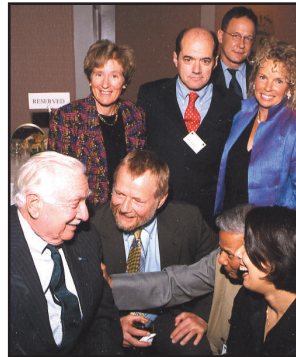
Walter Cronkite with Award Winners 2003